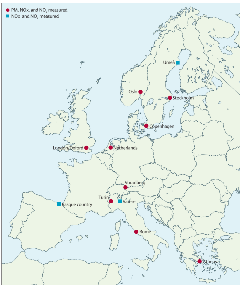
Figure 1: Areas where cohort members lived, measurements were taken, and land-use regression models for prediction of air pollution were developed NO 2 =nitrogen dioxide. NO x =nitrogen oxides (the sum of nitric oxide and nitrogen dioxide). PM=particulate matter.

Air pollution concentrations at the baseline residential addresses of study participants were estimated by land-use regression models in a three-step, standardised